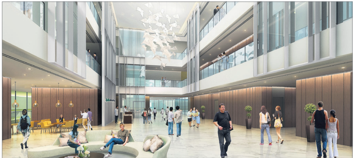
The new extension lobby features a generous triple volume space, giving visitors and patients a grand sense of arrival.

hospital rounds, and annual scientific meetings.